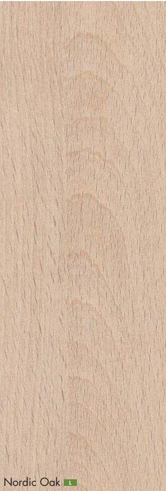
Nordic Oak L