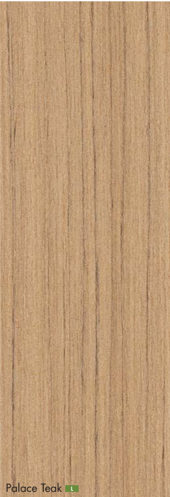
Palace Teak L