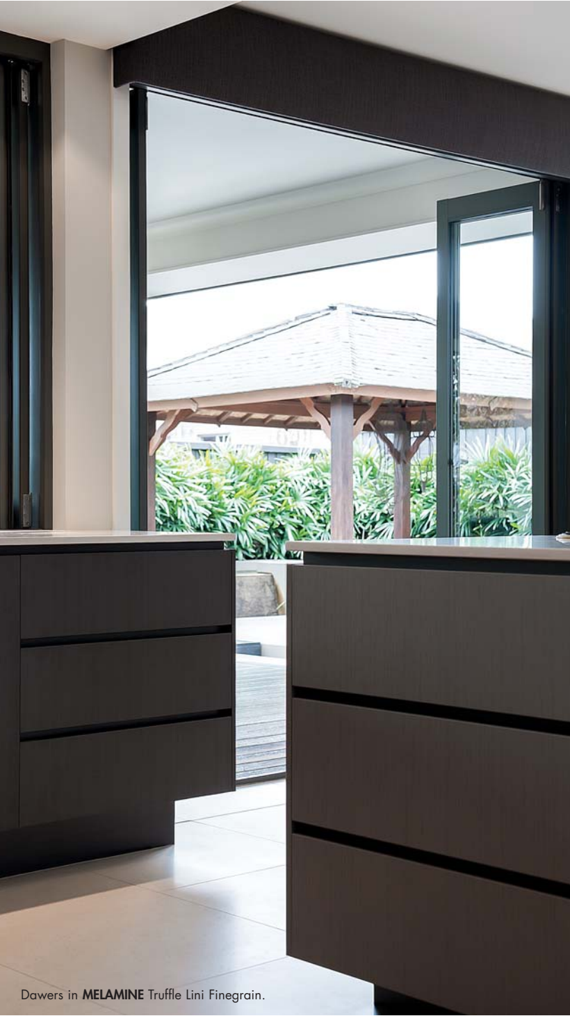
Dawers in MELAMINE Truffle Lini Finegrain.