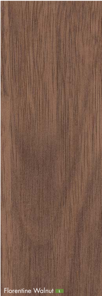
Florentine Walnut L