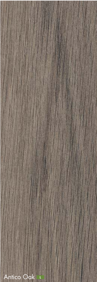
Antico Oak L