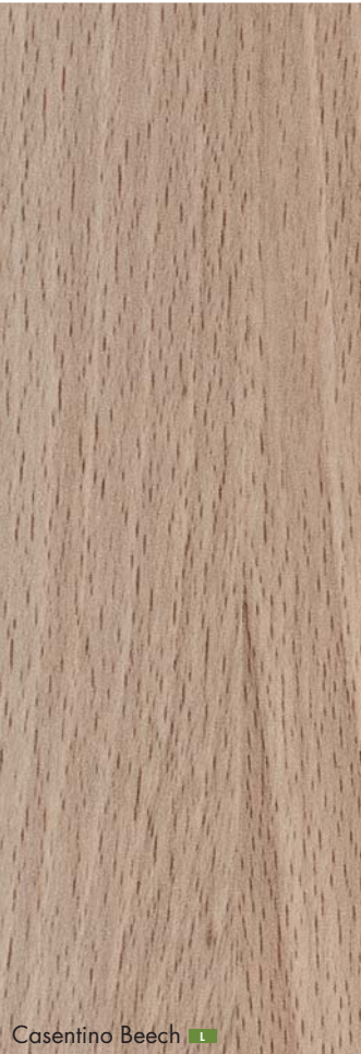
Casentino Beech L