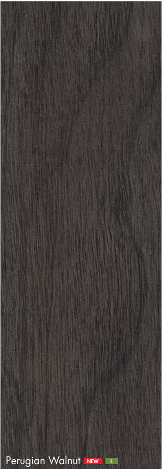
Perugian Walnut NEW L