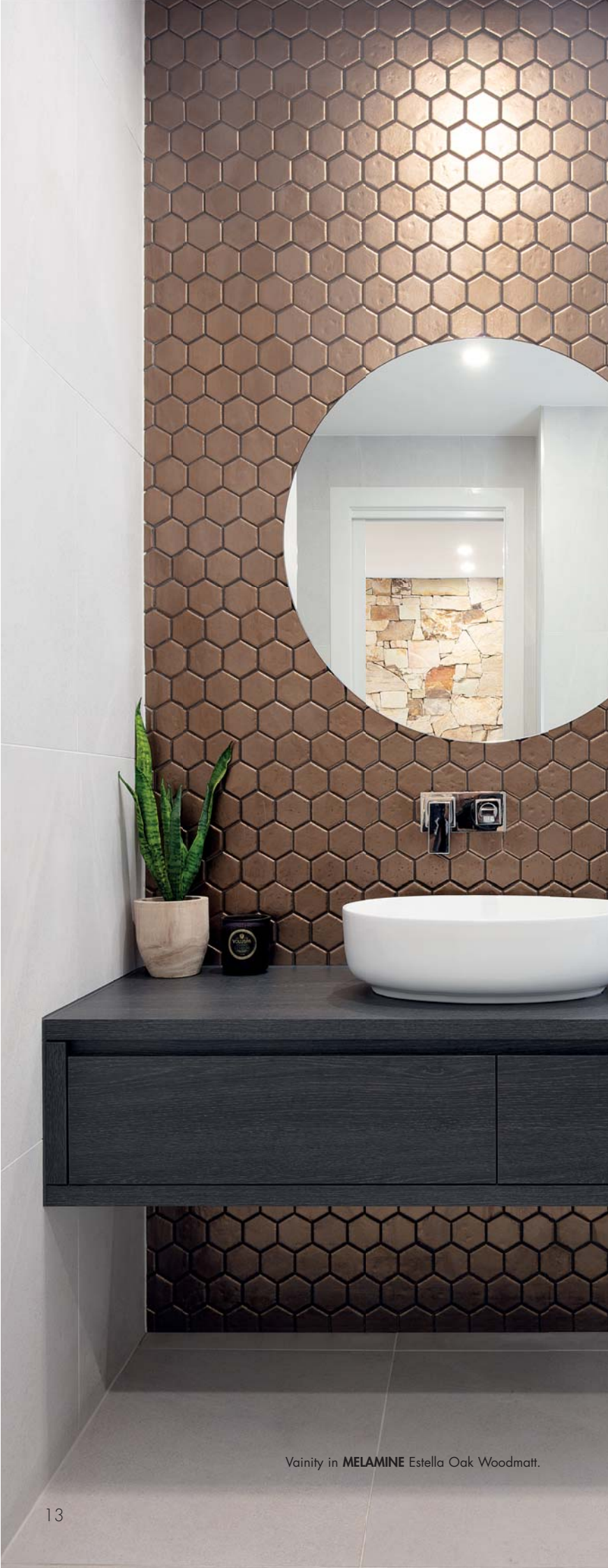
Vanity in MELAMINE Estella Oak Woodmatt.

Darker colours will show superficial wear and tear more readily than lighter coloured surfaces and require more care and maintenance.