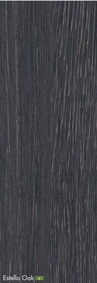
Estella Oak L