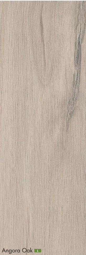
Angora Oak L