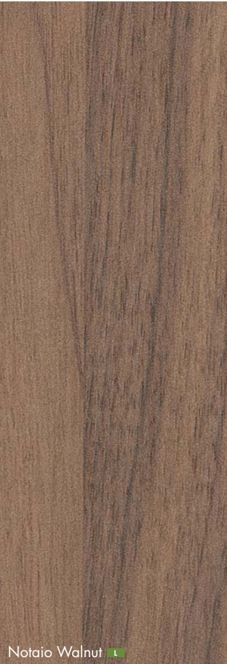
Notaio Walnut L