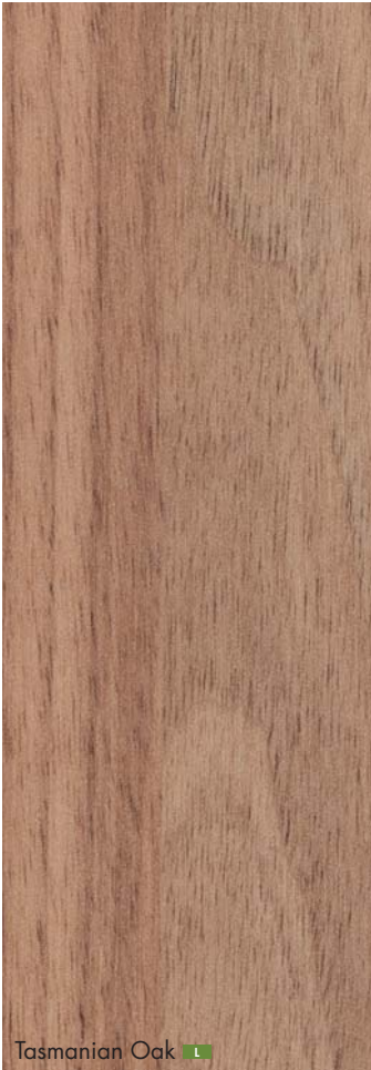
Tasmanian Oak L