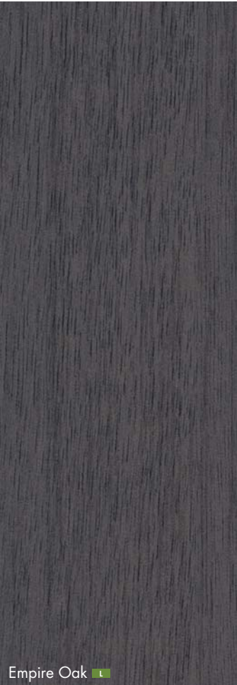
Empire Oak L