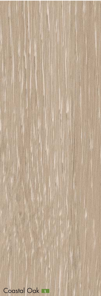
Coastal Oak L