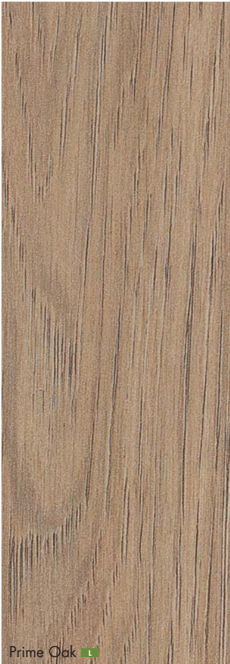
Prime Oak L