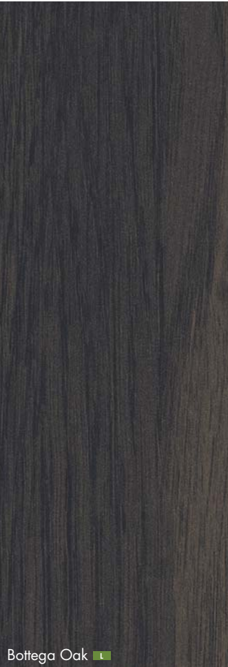
Bottega Oak L

Black also available in Matt, Texture and Finegrain finish.